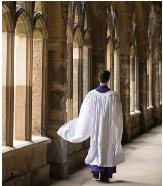
Cloister, Durham Cathedral